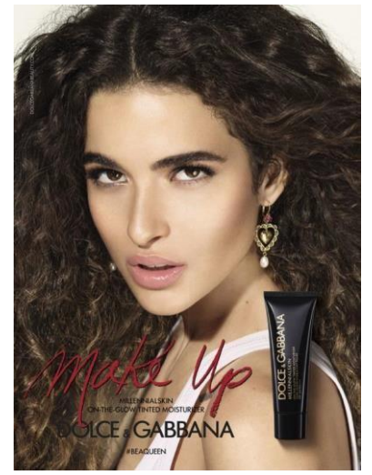
Figure 1. Visual Signs and Verbal Phrases in Dolce & Gabbana Millenialskin On-The-Glow Tinted Moisturizer Advertisement

In analyzing the symbolic meaning, the writer begins with visual and verbal phrases by Saussure's theory in this first advertisement below: